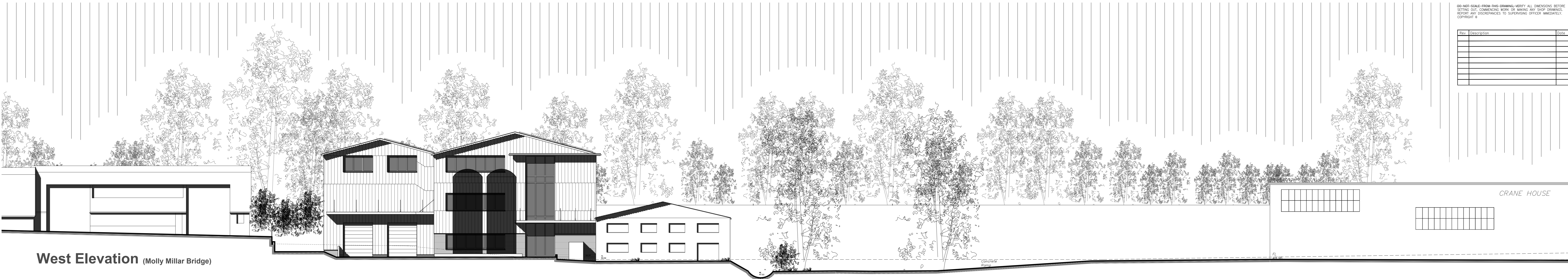
West Elevation (Molly Millar Bridge)